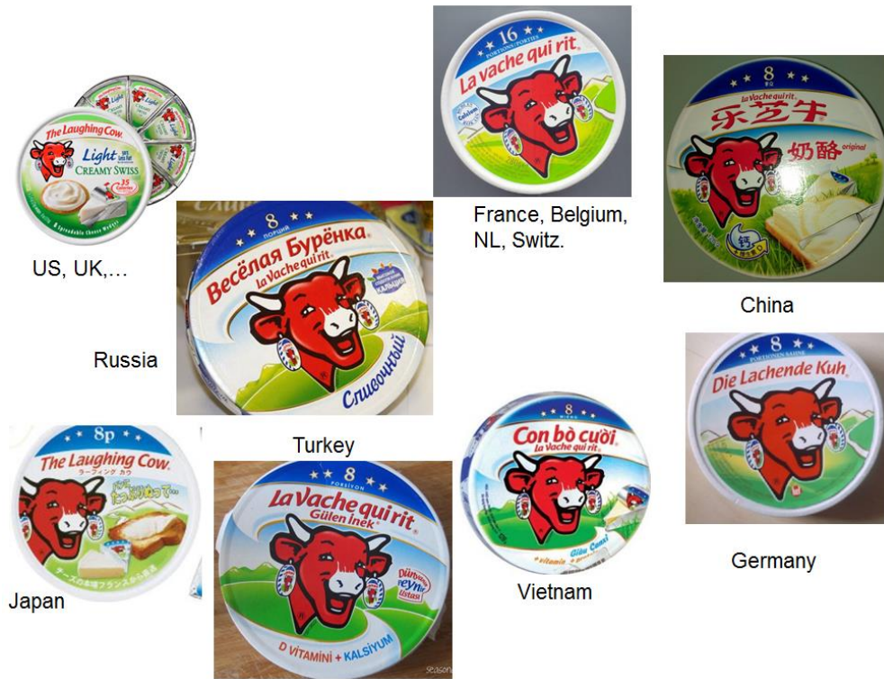
Figure 2 Global Brand Name Options